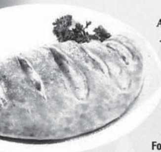
Folded Pizza Stuffed With Mixture of Cheeses.